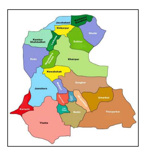
Fig. 1. Map of Sindh Province

In Sindh province, there are 29 districts. There are currently 47,886,051 people living in Sindh (Lajwani, 2010). At 0.628, Sindh has the second-highest Human Development Index among Pakistan's provinces. Pakistan has a population of 47.9 million, according to the 2017 Census. The Sindhis are the largest ethnic group in the province, but there is also a considerable presence of other tribes. Sindhis of Baloch ancestry make up over 30% of the total Sindhi population (although they speak Sindhi or Saraiki as their native language). In comparison, Urdu-speaking Muhajirs make up more than 19% of the province's total population, Punjabi make up 10%, and Pashtuns account for 7% (Wikipedia, 2022). Sindh's map is shown below.